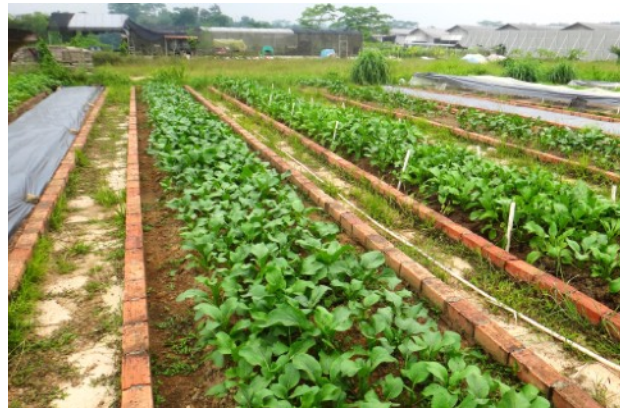
WATER TANK & IRRIGATION